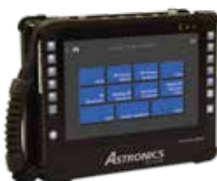
CTS-6000 RADIO TEST SOLUTION