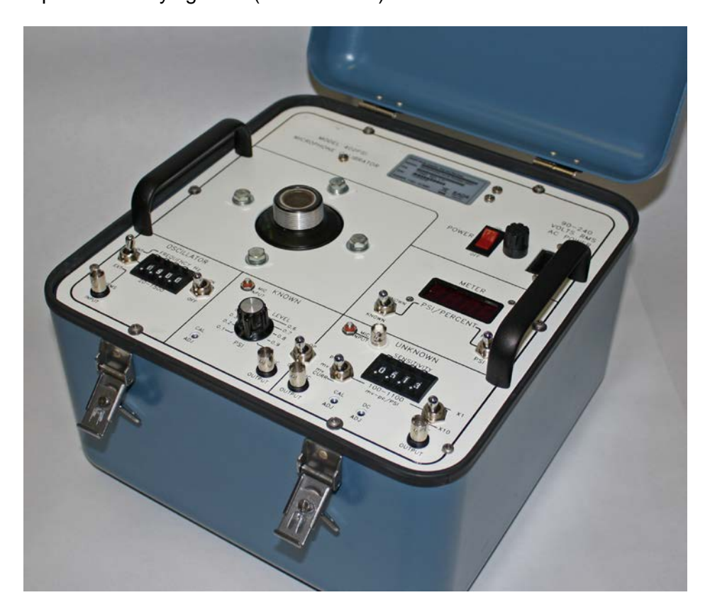
Figure 1-1, 402 PSI Microphone Calibrator

The 402PSI Microphone Calibrator ( Figure 1 ) is designed to provide calibration of high intensity microphones and pressure transducer. The 402PSI is housed in a portable carrying case (12"x12"x7.5").