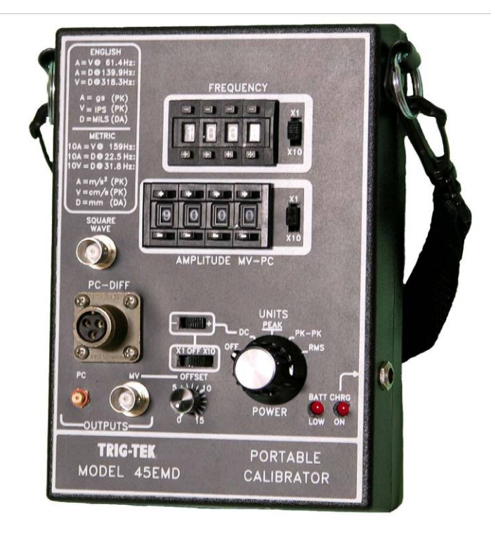
Figure 1-1, 45EMD Portable Calibrator

The 45EMD's output frequency is crystal controlled and accurate to .05%. Frequency is selectable from 10 to 999.9 Hz with 0.1 Hz resolution or 100 to 9999 Hz with 1.0 Hz resolution. A four-digit thumb switch and an X1 or X10 switch allow mV or pC level to be set from 0.1 to 999.9 with a 0.1 resolution or from 1.0 to 9999 with 1.0 resolution. Selectable output units include DC, PK, PK-PK or RMS. The mV output signal is on a BNC and the pC on a microdot connector. A differential pC output is provided on a three-pin connector. A DC offset voltage with selectable polarity can be superimposed on the AC outputs. Also a constant synchronous square wave output is provided. A carrying case and battery charger are included.