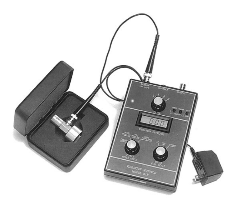
Figure 1-1, 61-Series Portable Vibration Monitor (61F Shown)

The 61R Portable Vibration Monitor ( Figure 1-1 and Figure 1-2 ) is intended for use in situations where a portable instrument is convenient or required. This unit will provide indication of acceleration using the input from an accelerometer, or millivolts with the current off. The unit is supplied with a charger pack that operates from 115 VAC line to recharge the battery.