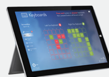
Easy Monitoring Solution